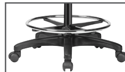
Optional drafting kit